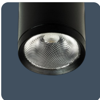
Wide optic - 33° beam