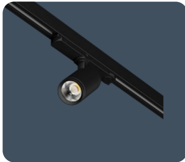
Track mounted DALI dimming in black